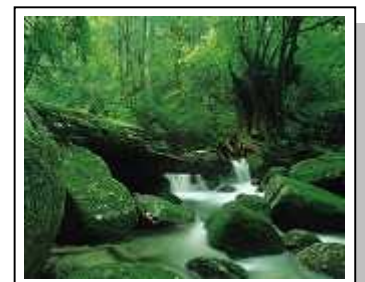
Shiratani Unsuikyo Ravine

【To Kigen-sugi Cedar】 (From) Town Office : ¥940 Anbo : ¥910 Yakusugi Museum : ¥800 Yakusugi Cedar Land : ¥300