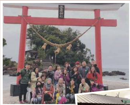
Visiting shrines on a bus tour. Kagoshima has a lot of spiritual power spots.