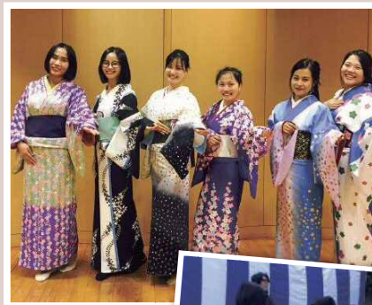
There are also many kimono wearing and tea ceremony events.