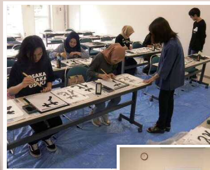
"Calligraphy Experience" Foreigners beautifully writing the Kanji character "Hana" (flower)