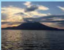
Sunset and Evening Cruise