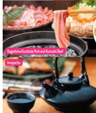
Kagoshima Kurobuta Pork and Kuroushi Beef