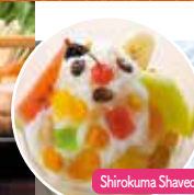
Shiokuma Shaved Ice