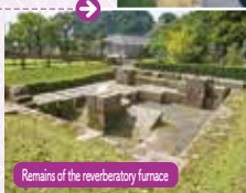
Remains of the reverberatory furnace

Shimadzu family stately home and gardens overlooking Sakurajima and Kinko Bay. There are restaurants and souvenir shops in the gardens. Various seasonal events are also held in Sengan-en.