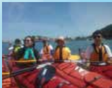
Sea Kayak Trip (Iso Beach)