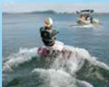
Jet Boat Cruise