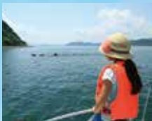
Kirishima Kinkowan Cruise