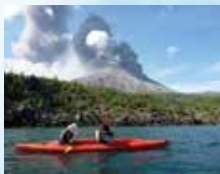
A half-day Sakurajima kayaking tour