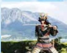
Shimadzu Samurai Armour Experience (Sengan-en)