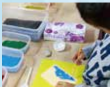
Sakurajima - Try creating a picture using volcanic ash