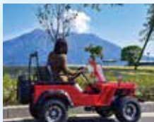
Free Tour of Kagoshima on a Mini Jeep