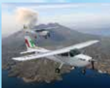
Sightseeing Flight: Sakurajima Course