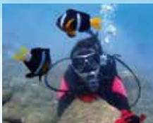
Diving for Beginners