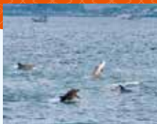
Dolphin Watching & Cruising