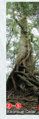
②-⑤ Kikinsugi Cedar