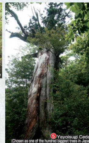
⑤ Yayoisugi Cedar (Chosen as one of the hundred biggest trees in Japan)