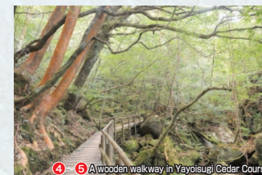
④-⑤ A wooden walkway in Yayoisugi Cedar Course